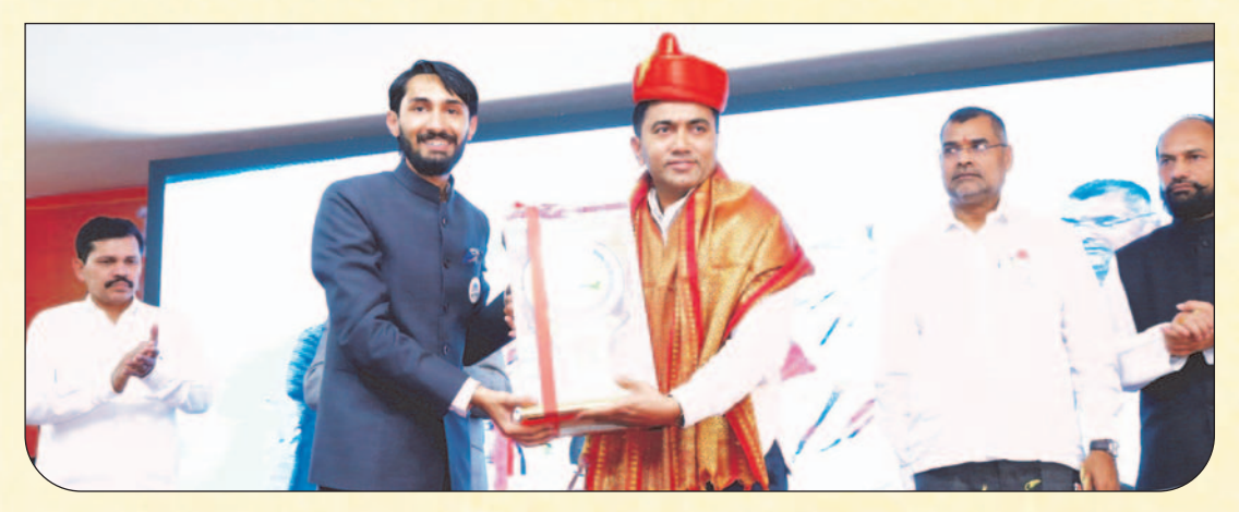
during the Youth Parliament programme (From left) former MLA Kapil Patil (Adarsh MLA), Chief Minister of Goa Hon. Pramod Sawant, Former Minister Sadabhau Khot