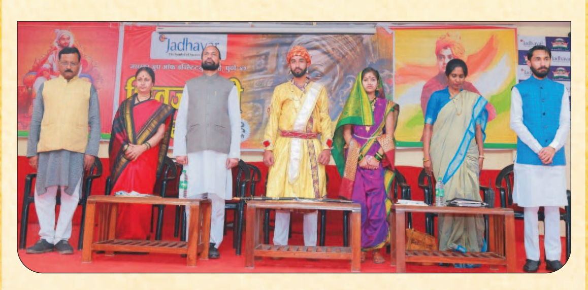
Shiv Jayanti Festival Programme