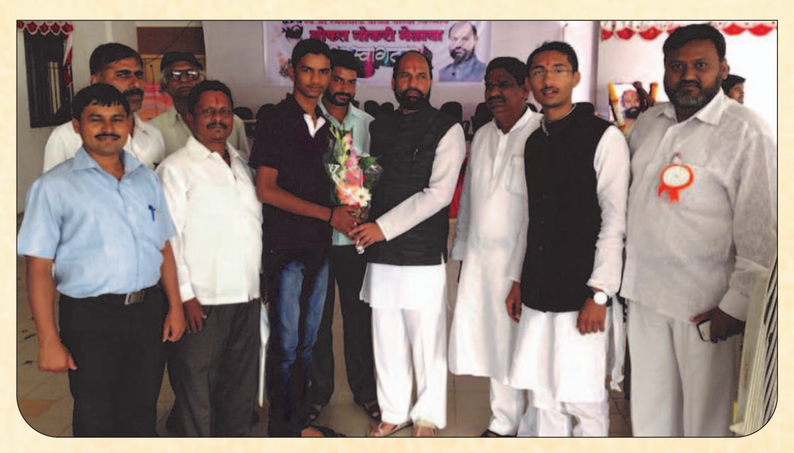
While felicitating the student who got the first job in the first employment fair.